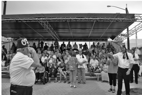
144TH IMPERIAL SESSION