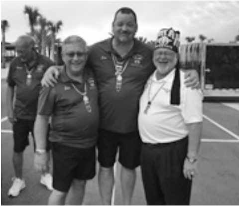
144TH IMPERIAL SESSION